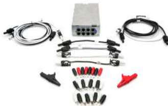
Logic I/O Module Accessories