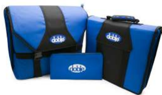
Instrument and Accessory Bags