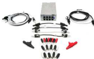
Logic I/O Module Accessories