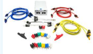
Current Module Accessories