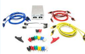
Voltage Module Accessories