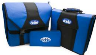
Instrument and Accessory Bags

The versatility of F8000-series Power System Simulators like this F8300 model let you easily scale your test capabilities to the requirements presented by your protection systems. Simply connect this F8300 to other F8000-series instruments to expand your use case possibilities.