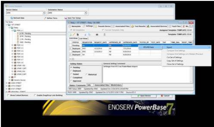
Relay records from PowerBase are exported to PB Field