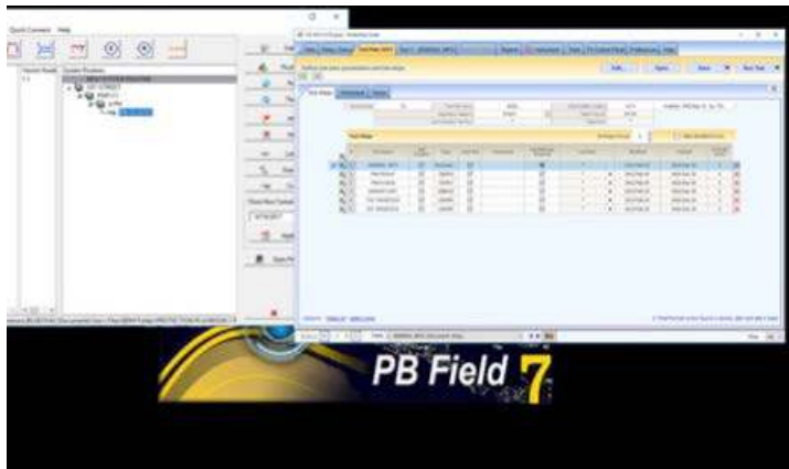
Protection Suite test macros are used from within PB Field test routines