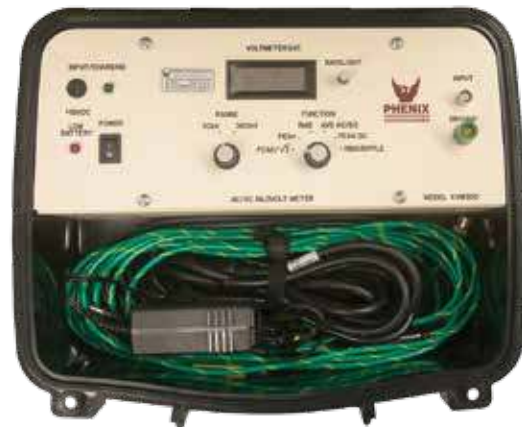
Metering Head for Model KVM300A