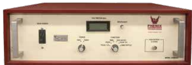
19" Rack Mount Metering Head