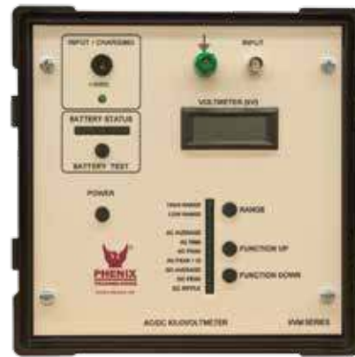
Metering Head for Models KVM50A, KVM100A and KVM200A