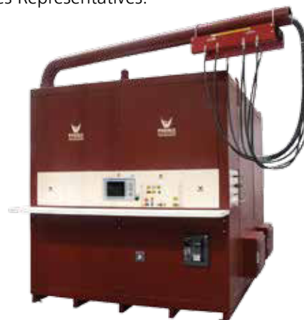
Model MTS1000R-800 with Swivel Boom