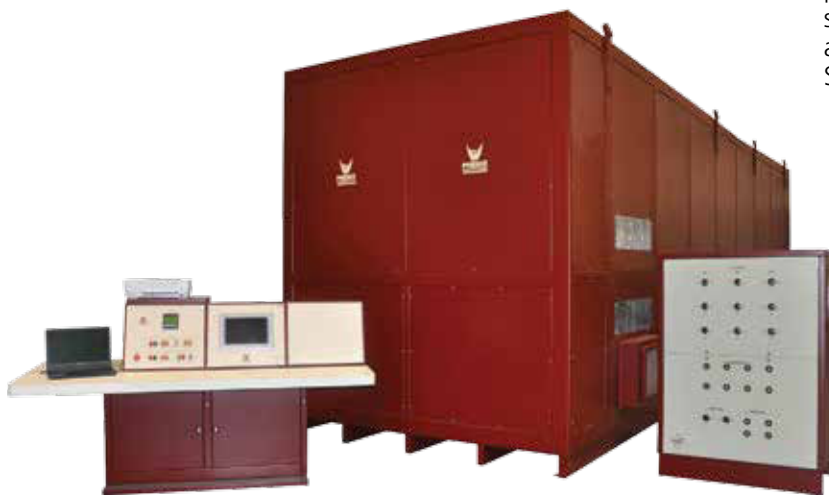
MTS R2 Series Model MTS5000R2-1000

The following information will assist you in choosing the power supplies, features, and options for a motor test system that meets your specific needs. For additional assistance, please consult one of Phenix Technologies Sales Representatives.