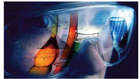
Doble provides complete laboratory analysis and engineering guidance.