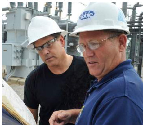
On-site condition assessment & consulting services