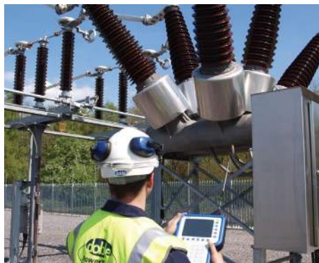
On-line substation partial discharge survey using Doble PDS100.