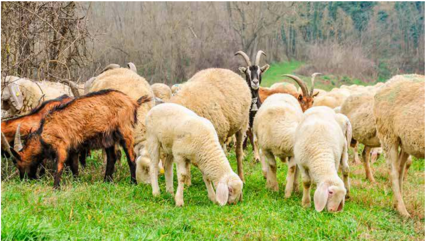
Figure 1. Sheep and goats