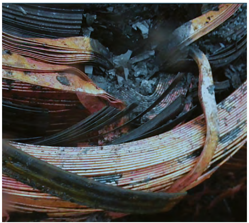
Figure 2. B-phase winding showing radial buckling damage with no shorted turns

[1] M. Wolf, 50 MVA Transformer failure as experienced by maintenance engineers, National Grid USA, 79th Annual International Doble Client Conference, Boston, USA, 2012