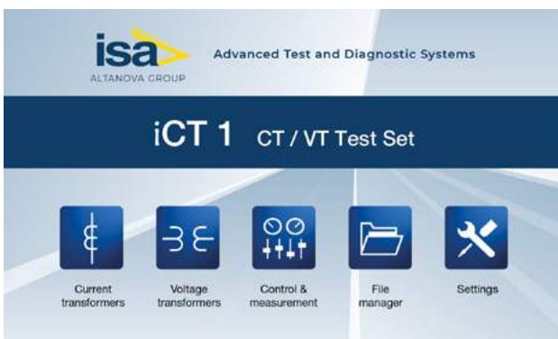
Main Menu Display